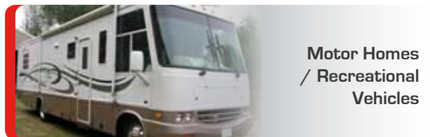
Motor Homes / Recreational Vehicles