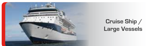
Cruise Ship / Large Vessels