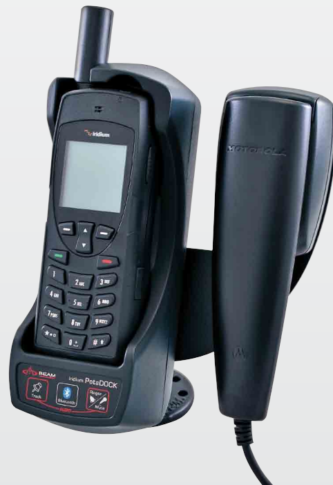
PotsDOCK 9555 with optional Privacy Handset